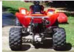
2004 Honda 45R in RED